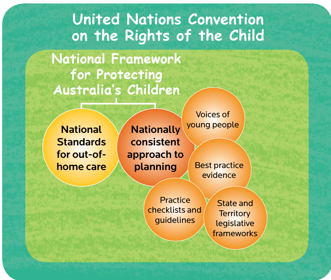
Figure 1 – contextual framework: Transitioning from out-of-home care to Independence: A Nationally Consistent Approach to Planning

The contextual framework of a nationally consistent approach is summarised in Figure 1.