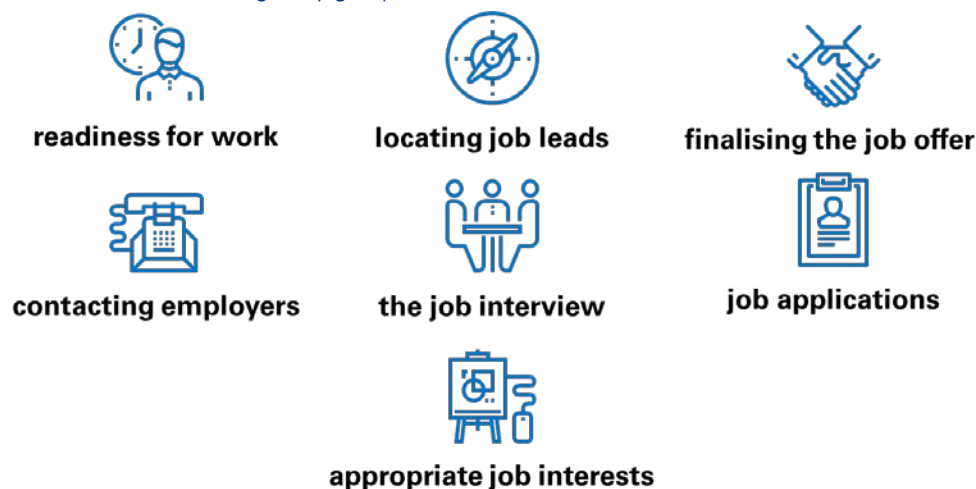
Figure 3: Seven elements encouraged by group activities