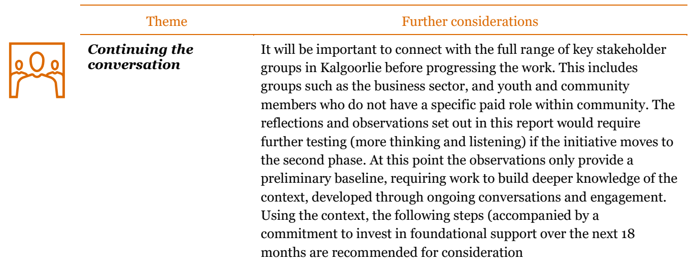
Table 1 Areas of focus for future foundational support in Kalgoorlie

Areas of focus have been recommended as per the below table within Section 5.2 of “Pre-Foundational Scoping – Kalgoorlie” in order to build these conditions for a collective impact approach. These are included below in Table 1.