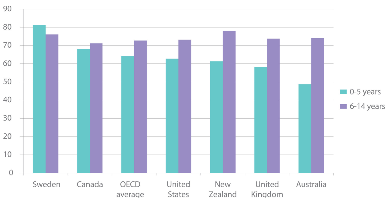
Figure 3: Employment rates of mothers by age of youngest child, 2009 3

The trends described above highlight how females in different countries have different patterns of employment after the birth of a child.